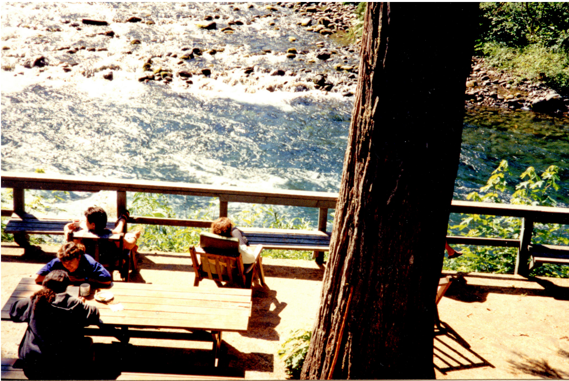
Terrace scene, view from second floor of lodge, 1990